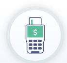
Point of Sale