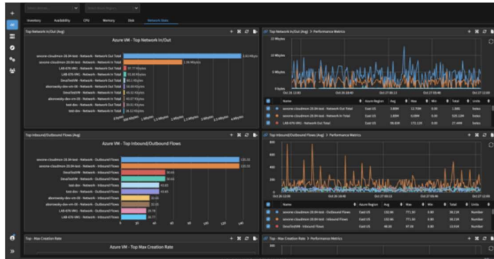
Proactive Issue Detection

SevOne enables deep automation, reducing the complexity of managing modern networks while enhancing operational efficiency.