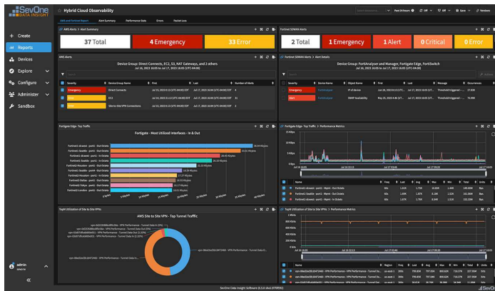
Hybrid Cloud Network Observability

Automation , a low-code network automation solution from IBM's 2024 acquisition of Pliant . This integration equips IT teams to act quickly by converting actionable insights into automated network responses.