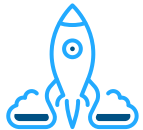
Speed to Insight