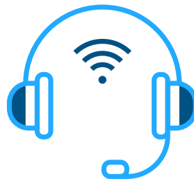
Unlimited Training + Support from Experts