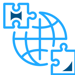
AI Powered Linguistics