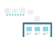
Automatic review reports cut down or eliminate time spent preparing document change reports

A medical writer reports that PleaseReview saves her, on average, 14 hours a week :