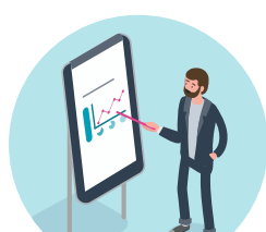
Controlled review process