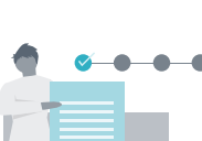
Fewer review cycles are required