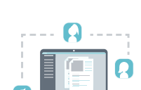
Everyone working on a document simultaneously causes fewer mistakes