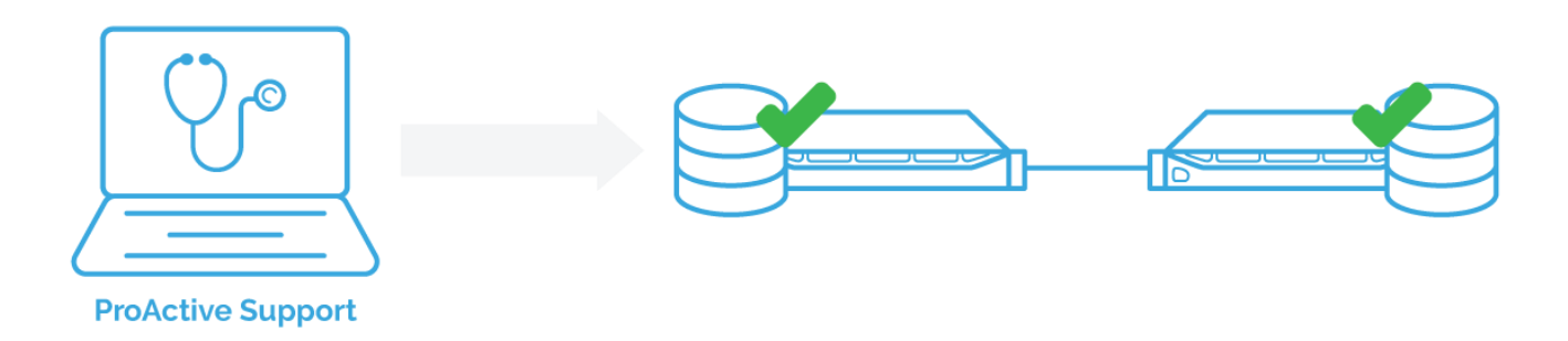
StarWind ProActive Premium Support resolves issues before they actually occur

StarWind ProActive Premium Support revolutionizes the way support works by resolving issues before they even appear. StarWind health service identifies the symptoms of any potential issue and informs our support team. In this way, StarWind reaches out the customer with a resolution, not a problem. Such an approach provides an unprecedented uptime for the applications and services and completely eliminates customer involvement in troubleshooting.