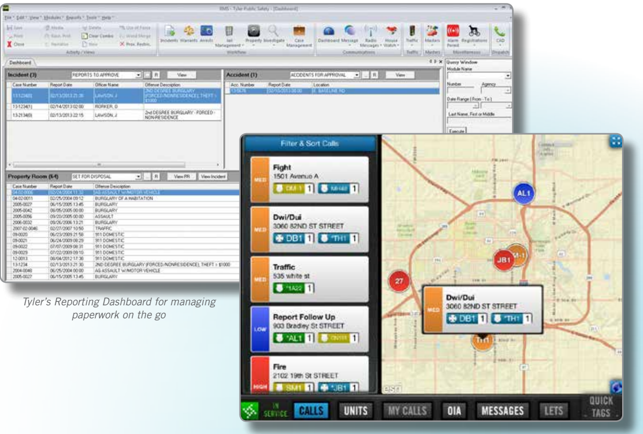
iPad application displaying CAD call details